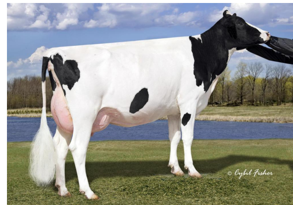
Seagull-Bay Miss America EX-91