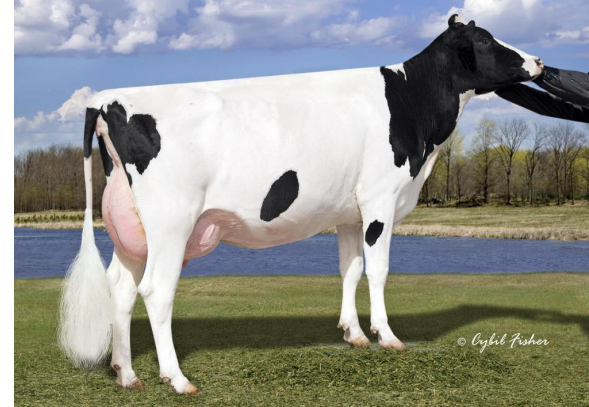
Seagull-Bay Miss America EX-91