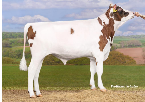
NH Evolution Skyliner-Red

Production RZM 129 Milk +2829 Fat % -0,56 Protein % -0,32 Fat kg +44 Protein kg +58